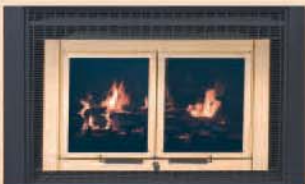
GOLD FRAME UNIT WITH GOLD DOORS

The Fuego Insert's positive flue connection sealing plate insures a tight seal and prevents dirt and smoke from re-entering firebox. It uses minimal air consumption similar to an air tight stove. Uses less air in one day than a conventional fireplace uses in an hour