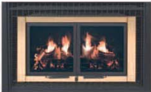
GOLD FRAME UNIT WITH BLACK DOORS