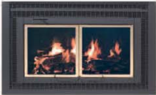
BLACK UNIT WITH GOLD DOORS